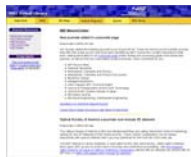
Recent NewsCenter posts

Post longer "white papers" monthly on other topics of interest that relate to libraries and publishing.