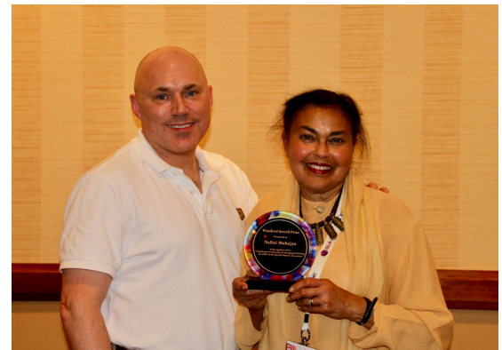
All Science & Engineering Poster Session