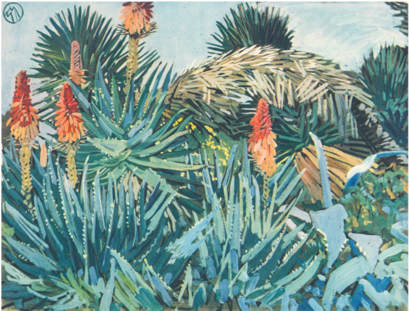
Artist's Depiction of Sonora Desert Vegetation on Display at the Phoenix Desert Botanical Garden (see preceding page)

Romund, G. 2017. Collaborative grant-seeking: a practical guide for librarians. de Farber, BG (Book review). Journal of the Canadian Health Libraries Association 38:1:34-35 doi: 10.5596/c17-006