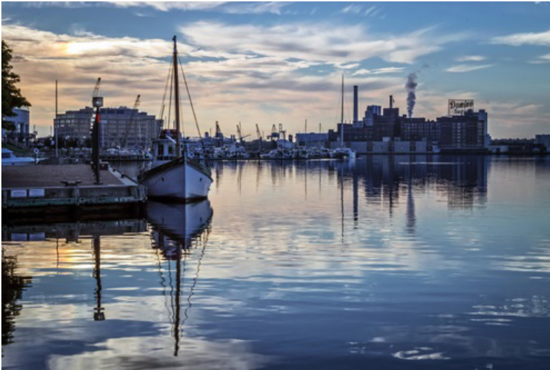
Baltimore Inner Harbor

If you're not registered yet, go here: Registration