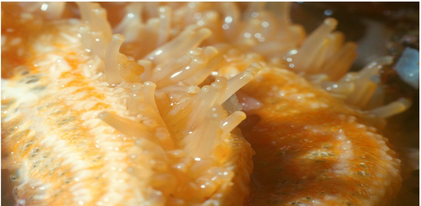
Starfish ultra-macro beam hand with suction cups