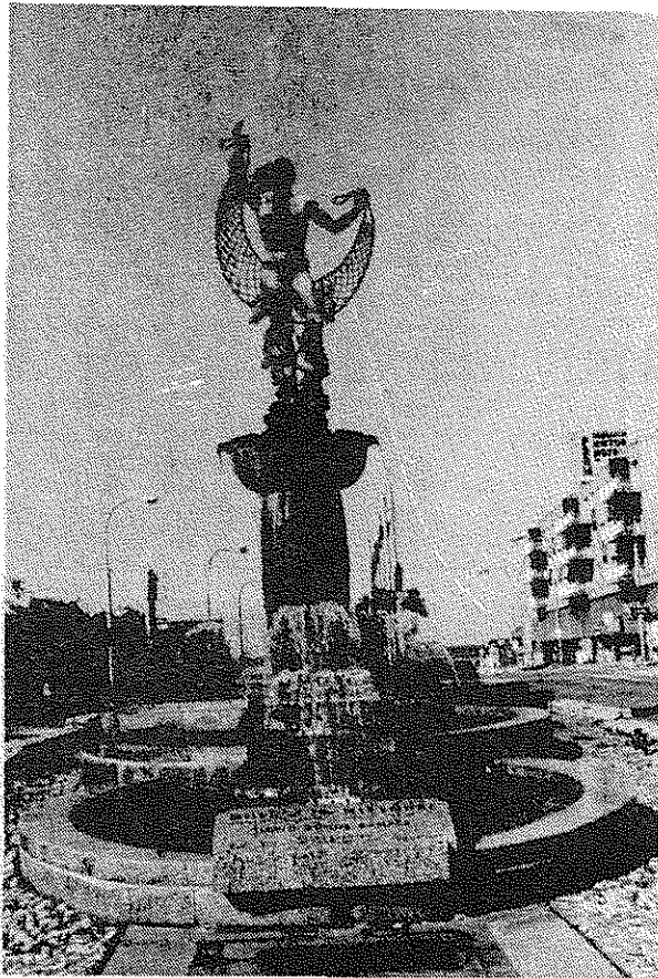
The Muse of Missouri beckons you to Kansas City. See articles inside!

A variety of topics were discussed or reported on in the joint cabinet/division meetings and in the division cabinet meetings. Among these were the following: the Governors' Conferences on Library and Information Services, yet to be held in most states; the question of boycotting states that have not ratified the Equal Rights Amendment in selecting Conference sites after 1981; a session of questions and answers regarding the new copyright law; networking in special libraries; a special meeting for making final plans for the Kansas City June 1978 Conference; a report on the current membership, which showed a significant increase during the past few years; the appointment of a Joint Cabinet Committee to Study Archives, composed of chapter/division cabinet members, to investigate the status of archives in divisions and chapters (I was appointed to serve on this committee); and a presentation was given regarding the 1979 Honolulu Conference.